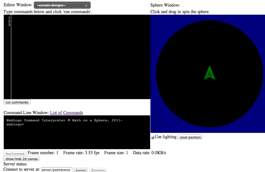
Figure 1. If MoS is working, you should see the above content in your web browser

Currently, Math on a Sphere (MoS) uses WebGL to display the designs you create on the rotatable sphere. WebGL is not yet supported on all computers. To see if MoS works on your computer, go to http://ponder.org.uk/weblogo/client.html